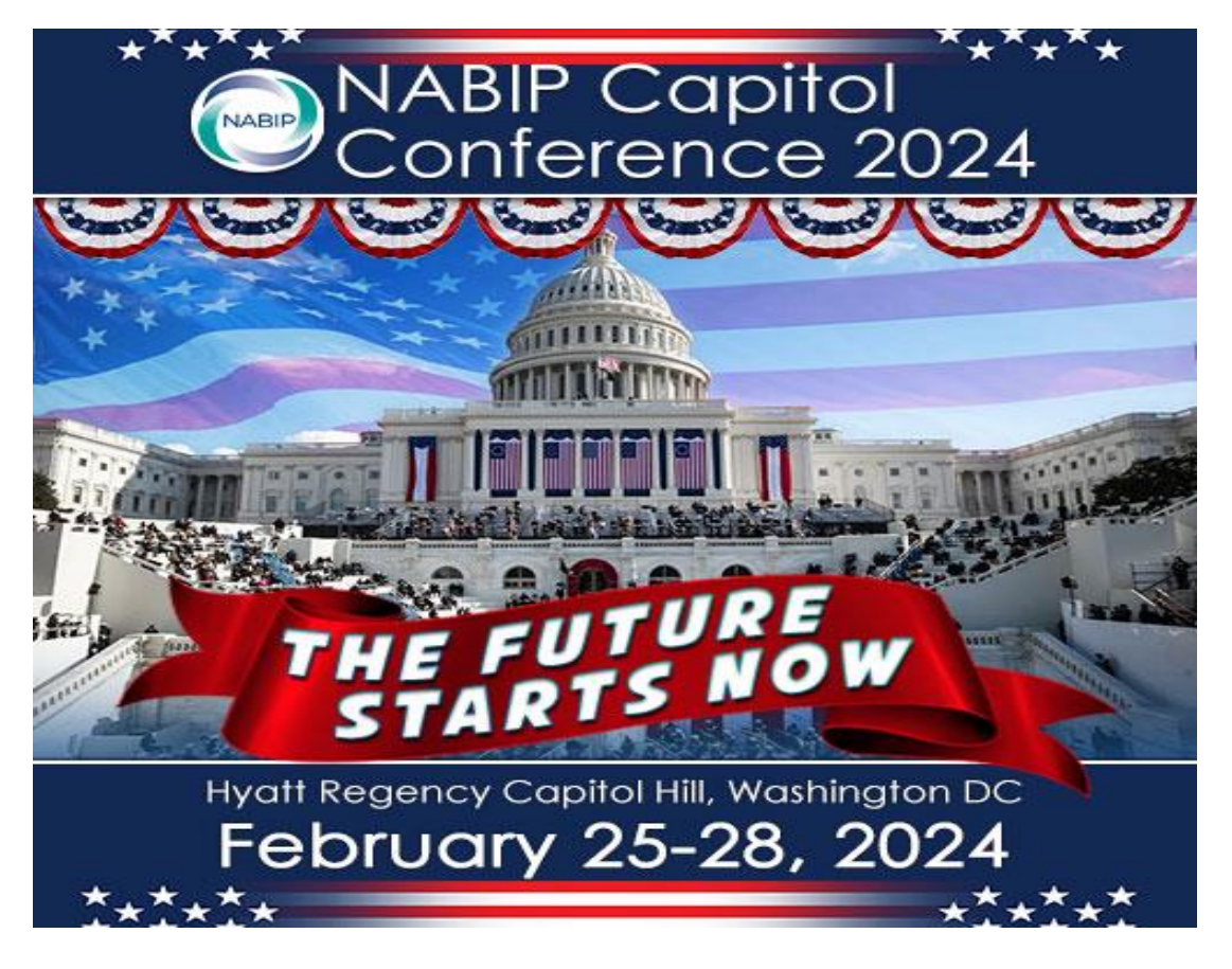
A few of the highlights: